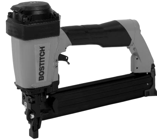
TOOL PARTS ILLUSTRATION