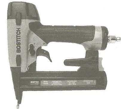
TOOL PARTS ILLUSTRATION ILUSTRACIÓN DE LAS PIEZAS DE LA HERRAMIENTA ILLUSTRATION DES PIÈCES D'OUTILLAGE

OIL-FREE STAPLER GRAPADORA SIN ACEITE AGRAFEUSE SANS HUILE